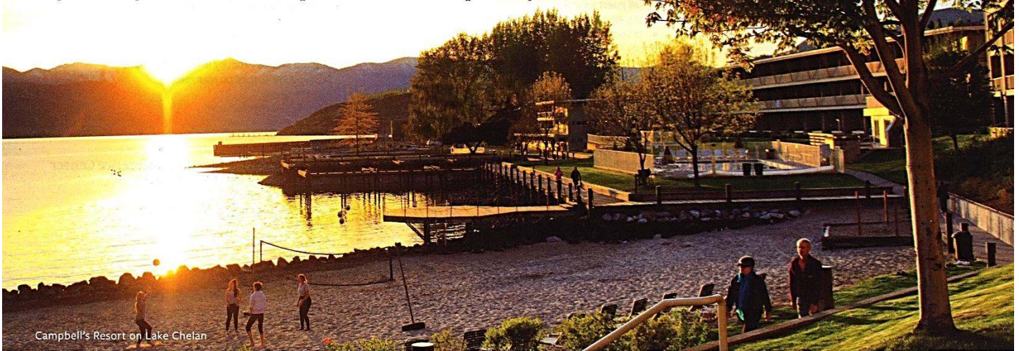
Campbell's Resort on Lake Chelan

Mid-way between Seattle and Spokane, on the sunnier side of the Cascade Mountains, north central Washington offers a variety of meeting venues and a robust local food and beverage scene, along with welcoming small-town vibes. In addition to Wenatchee, the region's largest city, outstanding event facilities are found in the Bavarian village of Leavenworth, scenic Lake Chelan valley and the western-themed town of Winthrop. Along this easternmost stretch of the Cascade Loop Scenic Highway, grand vistas greet you at every turn and recreation options abound in close proximity.